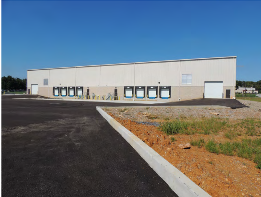
REAR VIEW WITH DOCKS AND DRIVE INS