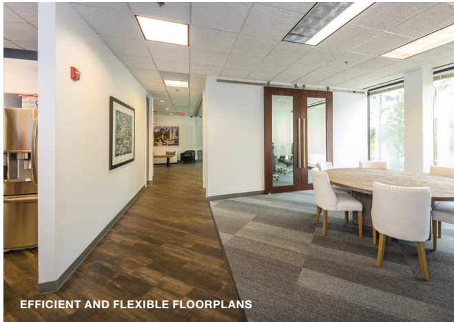
EFFICIENT AND FLEXIBLE FLOORPLANS