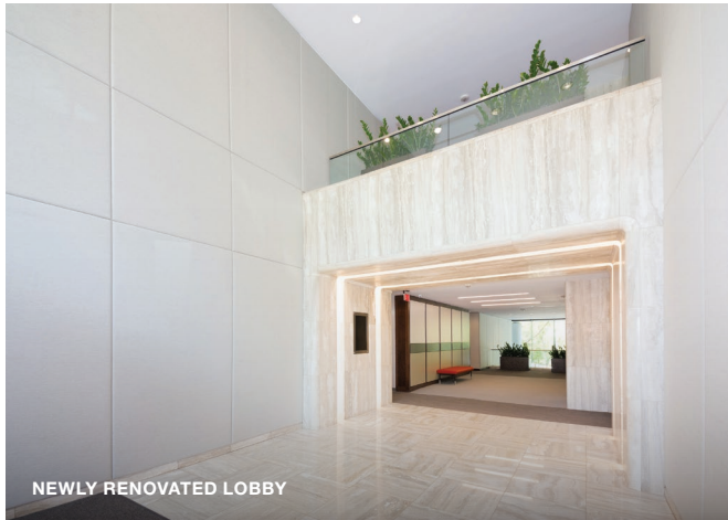
NEWLY RENOVATED LOBBY