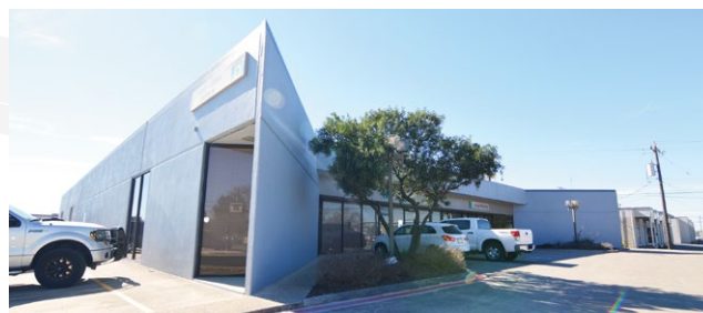
BLDG D: BITTERS RD. $8.00 - $8.50/SF | OPEX - $3.82/SF 2564 11,181 SF DOWNLOAD (AVAIL. 11/1/17)