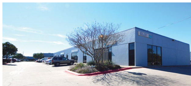
BLDG C: BOARDWALK ST. $9.50 - $10.00/SF | OPEX - $3.82/SF 2513 1,625 SF DOWNLOAD 2517 1,636 SF DOWNLOAD