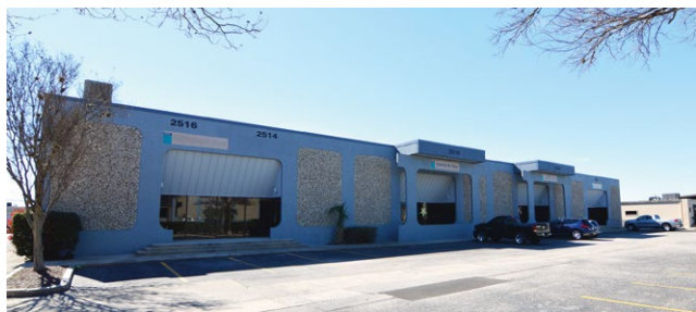
BLDG B: FREEDOM ST. $9.50 - $10.00/SF | OPEX - $3.39/SF 2516 2,000 SF DOWNLOAD