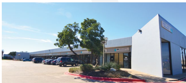
BLDG A: BROADWAY ST. $10.50 - $11.00/SF | OPEX - $3.82/SF Contiguous for total of 4,000 SF 10109 2,000 SF DOWNLOAD 10107 2,000 SF DOWNLOAD