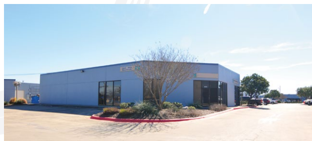
BLDG B: BOARDWALK ST. $9.50 - $10.00 | OPEX - $3.82/SF Contiguous for total of 3,248 SF 2537 1,623 SF DOWNLOAD 2539 1,625 SF DOWNLOAD (AVAIL. 11/1/17)