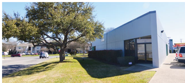
BLDG E: BROADWAY ST. $10.00 - $12.00/SF | OPEX - $3.27/SF 10025 5,187 SF DOWNLOAD (Freestanding; 100% office; 5.5/1,000 parking)