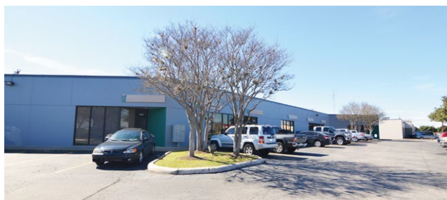
BLDG F: BOARDWALK ST. $9.50 - $10.00/SF | OPEX - $3.27/SF 2550 2,020 SF DOWNLOAD 2564 1,818 SF DOWNLOAD