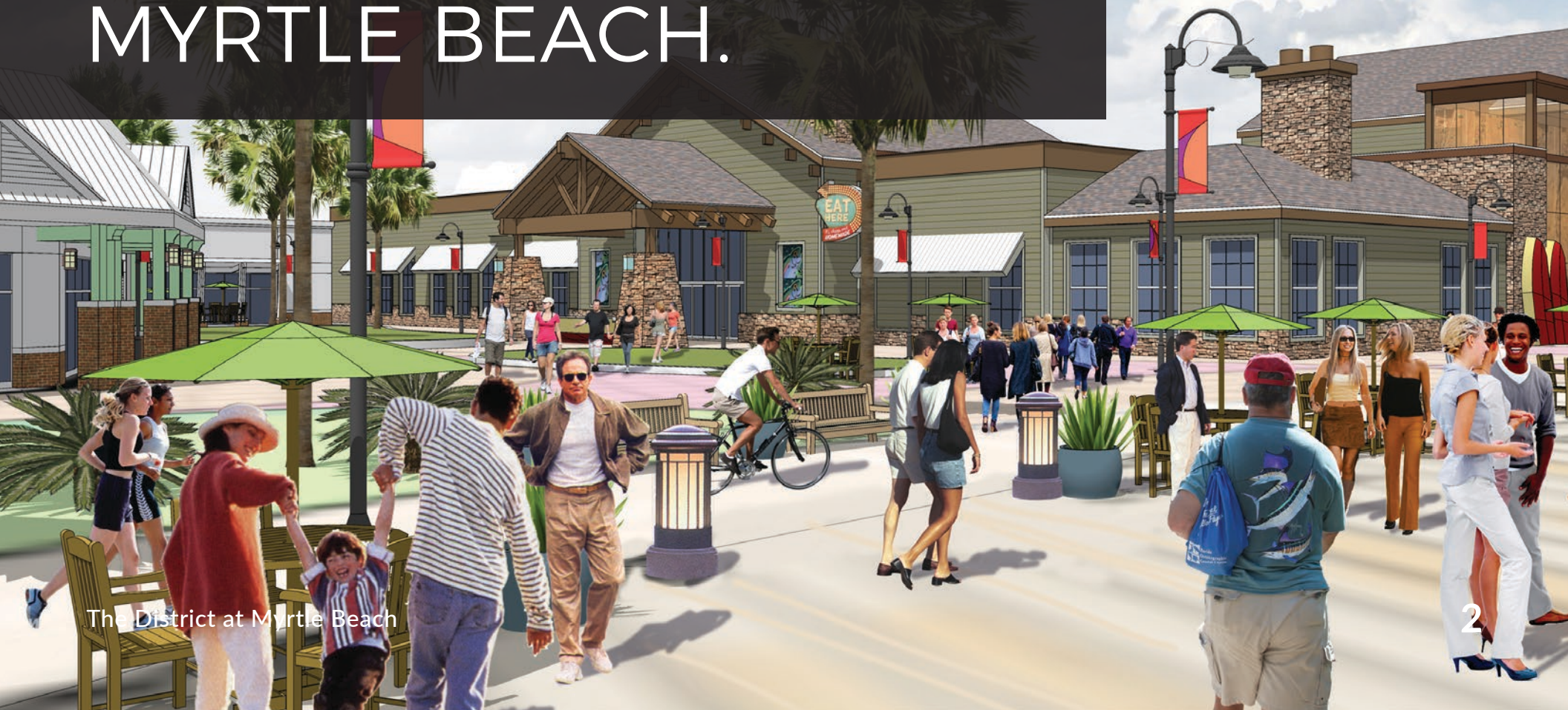
The District at Myrtle Beach

THE DISTRICT IS THE PLACE TO EXPERIENCE THE EXCITEMENT OF MYRTLE BEACH.