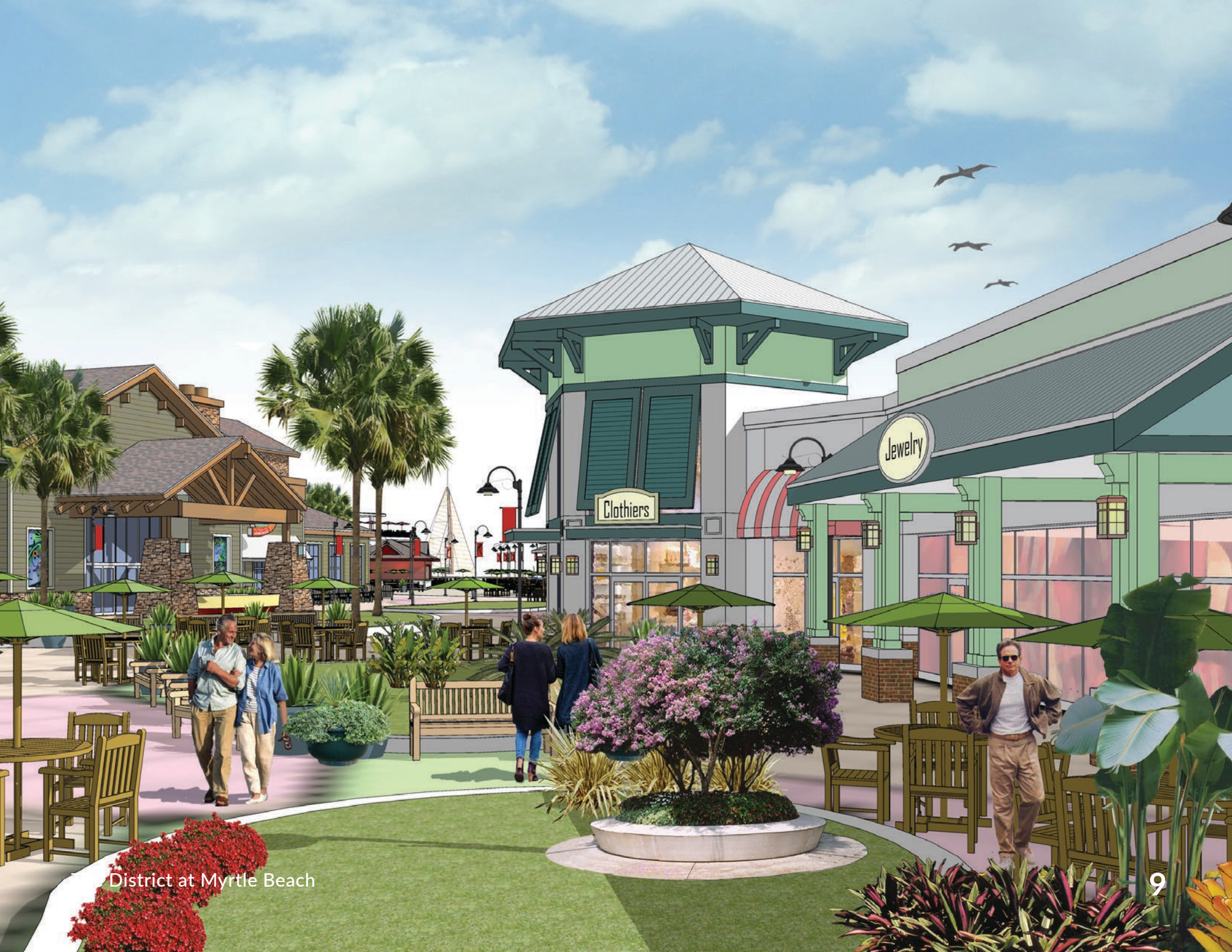
District at Myrtle Beach