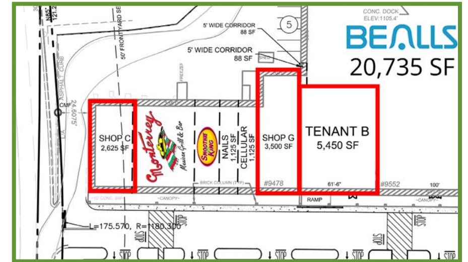
Zoom in of available shop space