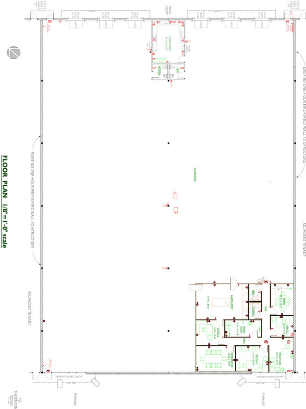
FLOOR PLAN 1/8" = 1'-0" scale

RANDALL BRYAN Vice President 404.942.2015 rbryan@kingindustrial.com