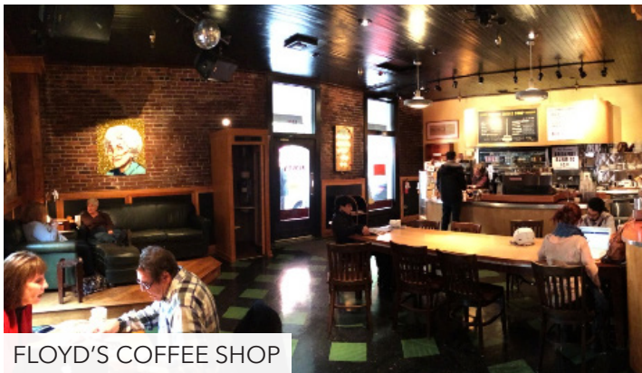
FLOYD'S COFFEE SHOP