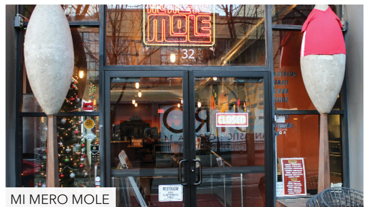
MI MERO MOLE