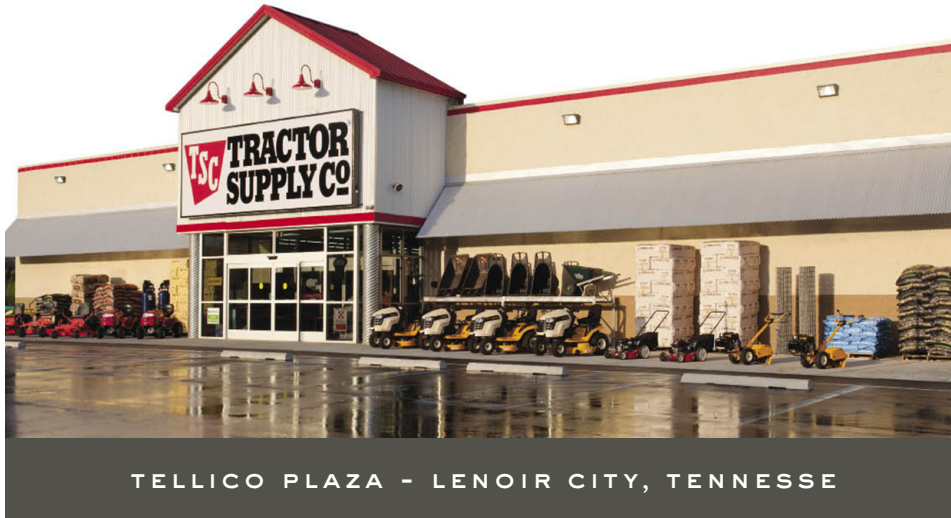
TELLICO PLAZA - LENOIR CITY, TENNESSE

785 HIGHWAY 321 NORTH LENOIR CITY, TN 37771