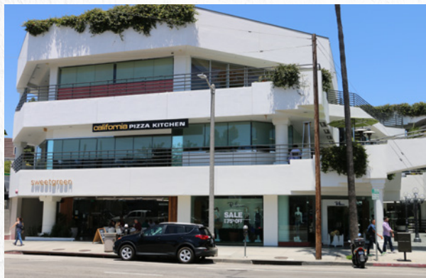
SWEETGREEN, CPK, RON HERMAN, BOTTLEFISH (BRENTWOOD GARDEN)