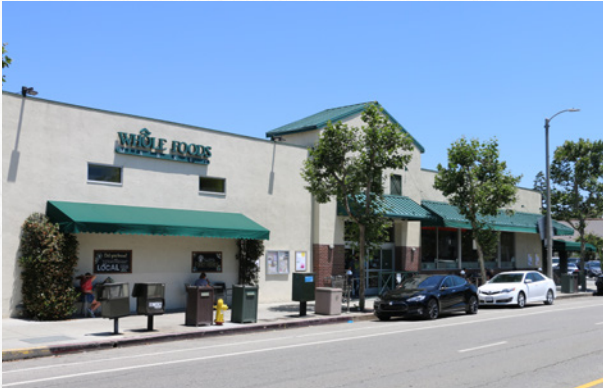
WHOLE FOODS MARKET