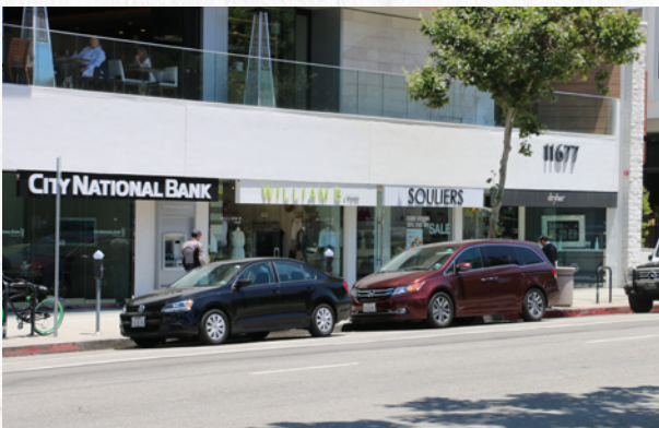
DRY BAR, WILLIAM B & FRIENDS (BRENTWOOD GARDEN)