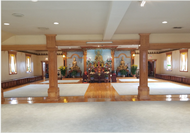
Large Meeting Room