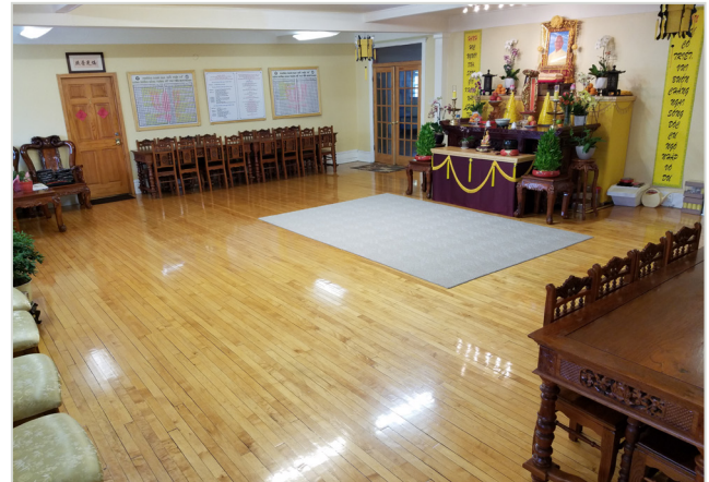
Small Meeting Room