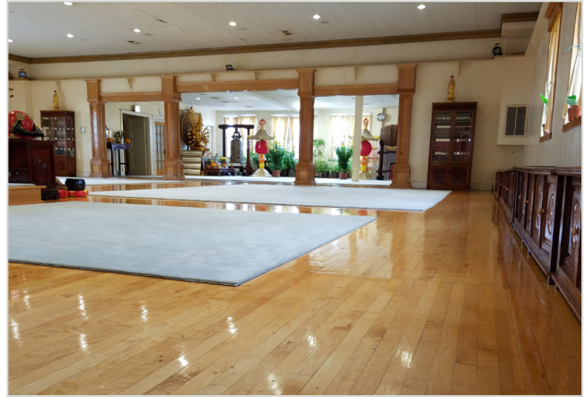
Large Meeting Room