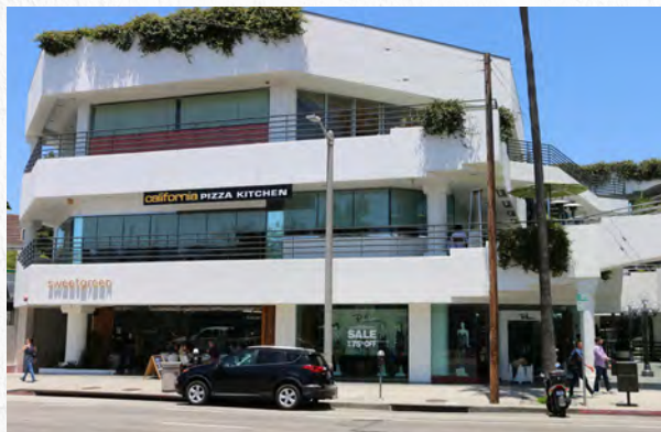
SWEETGREEN, CPK, RON HERMAN, BOTTLEFISH (BRENTWOOD GARDEN)