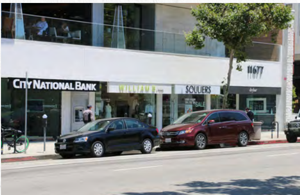
DRY BAR, WILLIAM B & FRIENDS (BRENTWOOD GARDEN)