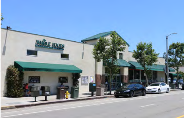
WHOLE FOODS MARKET