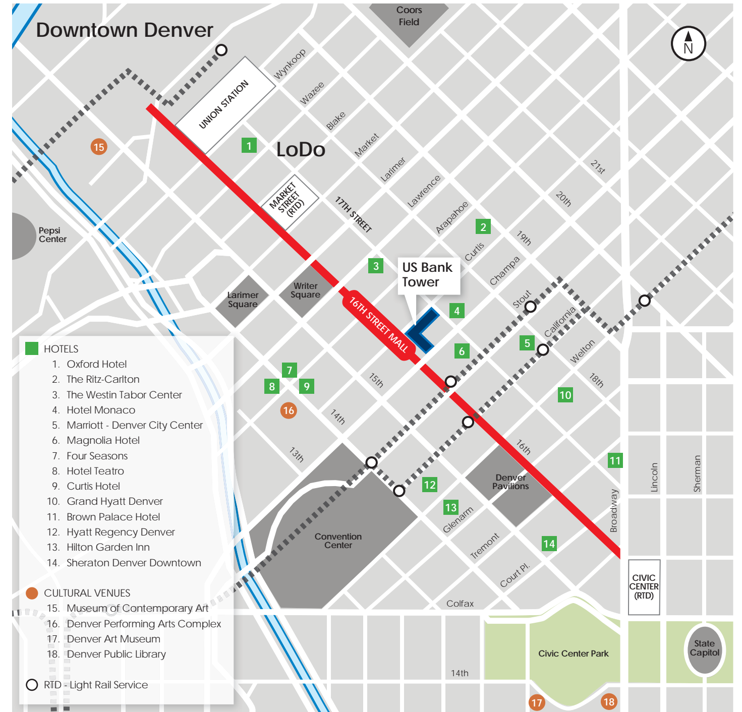
US Bank Tower 950 17TH STREET, DENVER CO