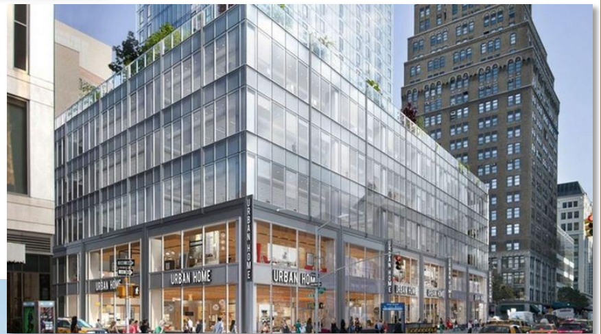
855 Sixth Avenue - Nordstrom Rack and Nike headquarters