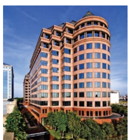
Providence Towers Dallas, Texas