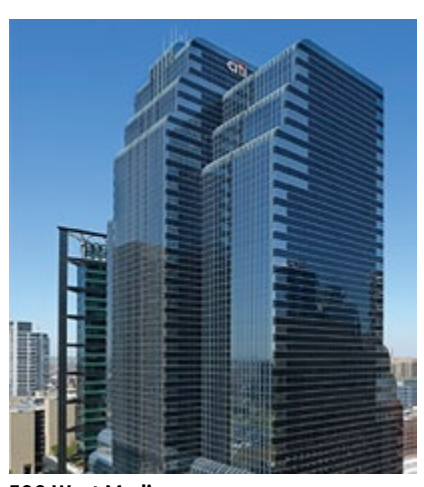
500 West Madison Chicago, Illinois