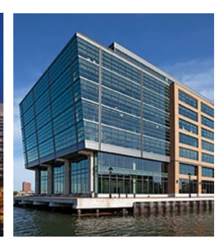
Thames Street Wharf Baltimore, Maryland