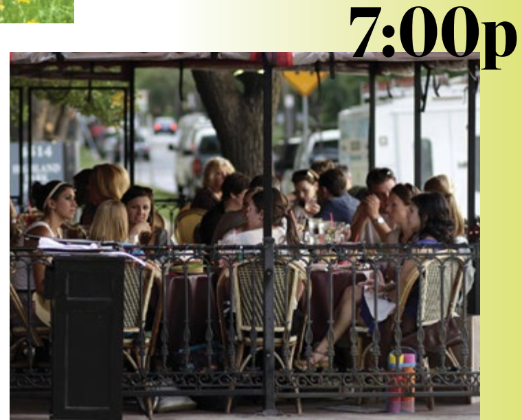
COCKTAILS AT SANGRIA

Located adjacent to Highland Park Place and rated one of the top 20 restaurants in the city, Abacus is the perfect place to enjoy Dallas' finest gourmet cuisine at the end of the day.