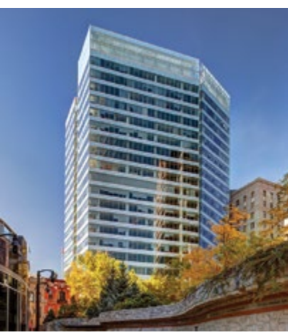
222 Main Salt Lake City, Utah

We know it's not only where you do business that matters, but how you do business. Our "hands-on" approach has led us to many successes, gaining us profound trust with our clients. At KBS, we believe our people are our greatest asset and our tireless efforts to conduct good business has not only earned us repeat investment opportunities, but also formed long lasting relationships.