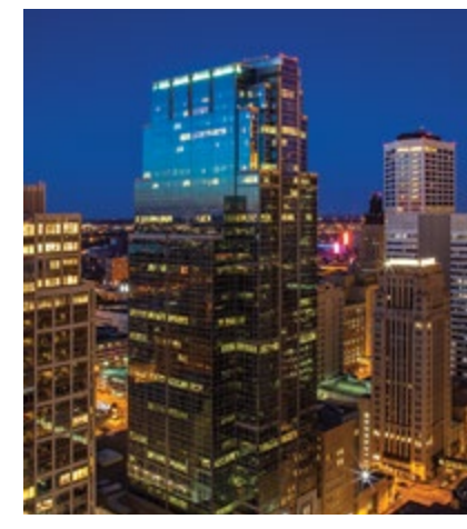
RBC Plaza Minneapolis, Minnesota