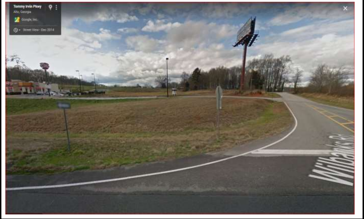
All materials furnished is from sources deemed reliable, but information has not been verified and is subject to errors or omissions