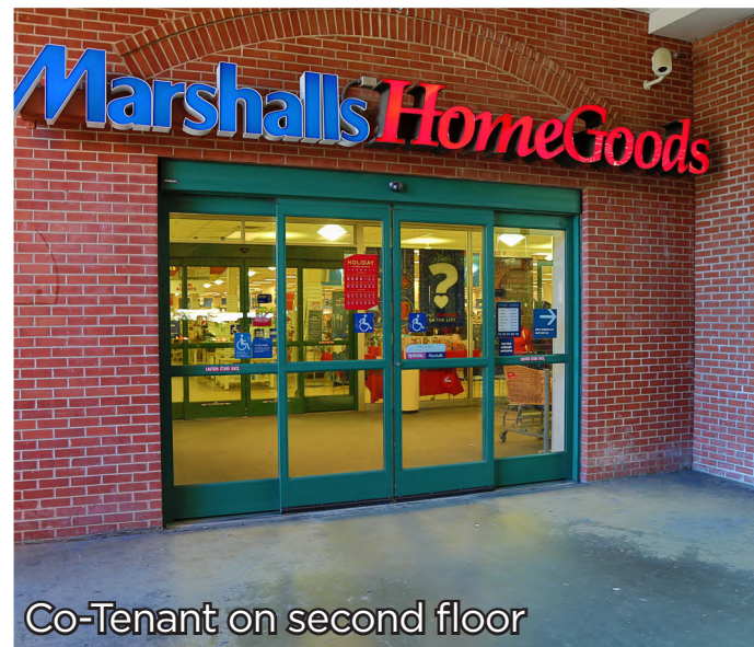
Co-Tenant on second floor