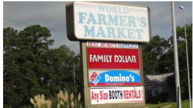
Signage on Mercer Univ. Dr.