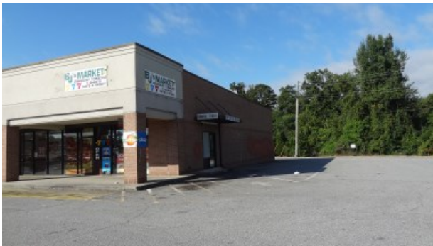
Side of Building