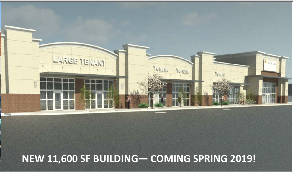
NEW 11,600 SF BUILDING— COMING SPRING 2019!