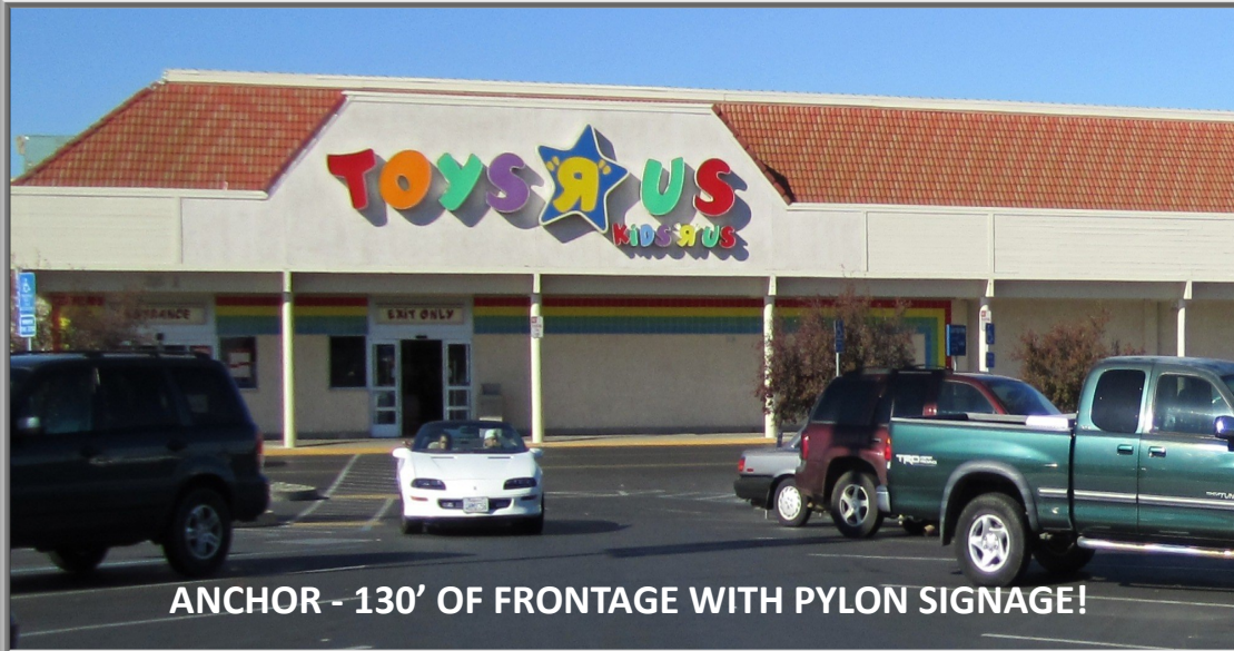
ANCHOR - 130' OF FRONTAGE WITH PYLON SIGNAGE!