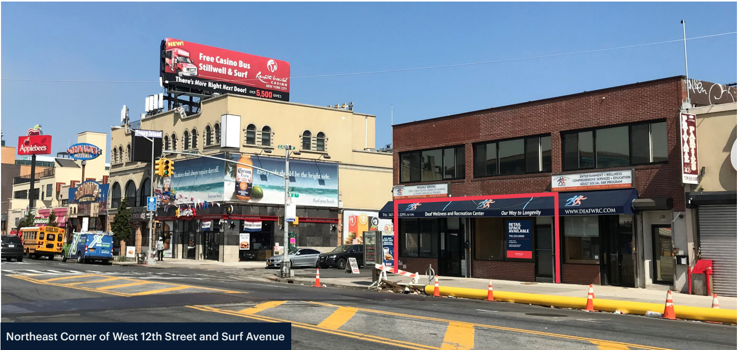
Northeast Corner of West 12th Street and Surf Avenue