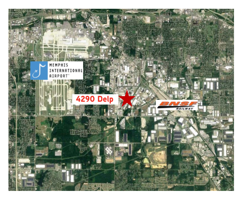
Located in the dominant Southeast submarket, east of the Memphis International Airport