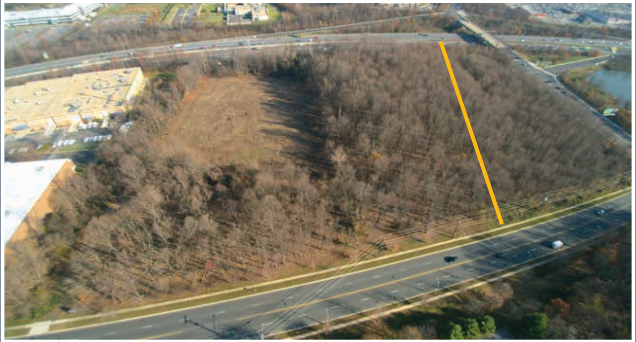
Site just recently cleared. Good topography, good depth, incredible visibility.