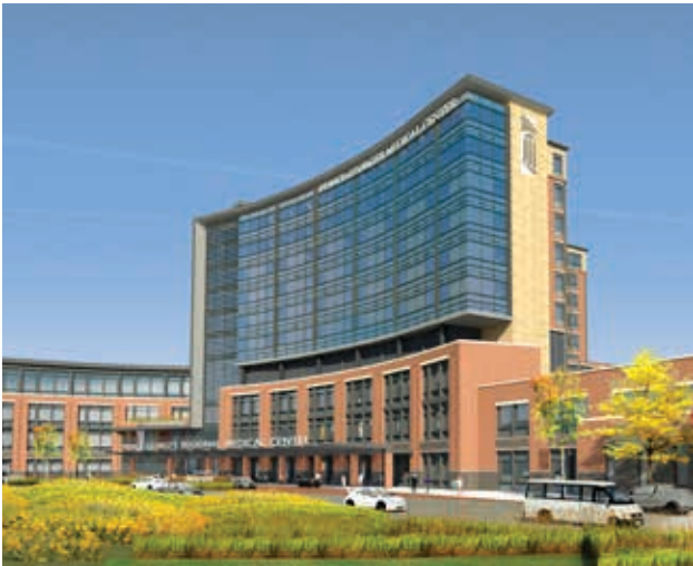
Prince George’s County Regional Medical Center