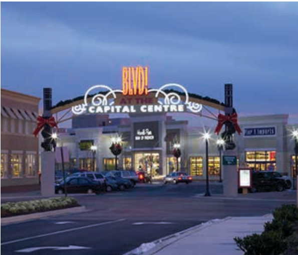
Boulevard at the Capital Centre