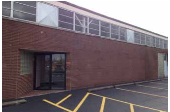
Main Office Entry