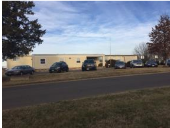
Front of building