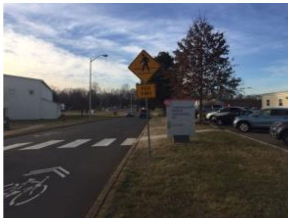
View of Aiken Drive (west)