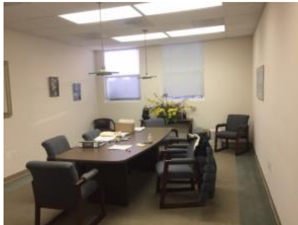
2 nd floor area