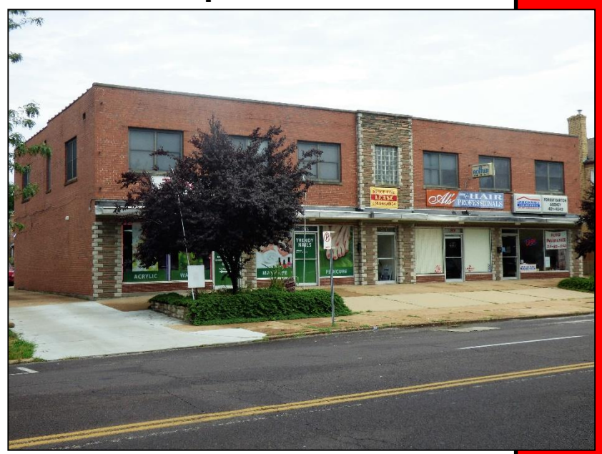
$400/Month F.S.G. Per Suite