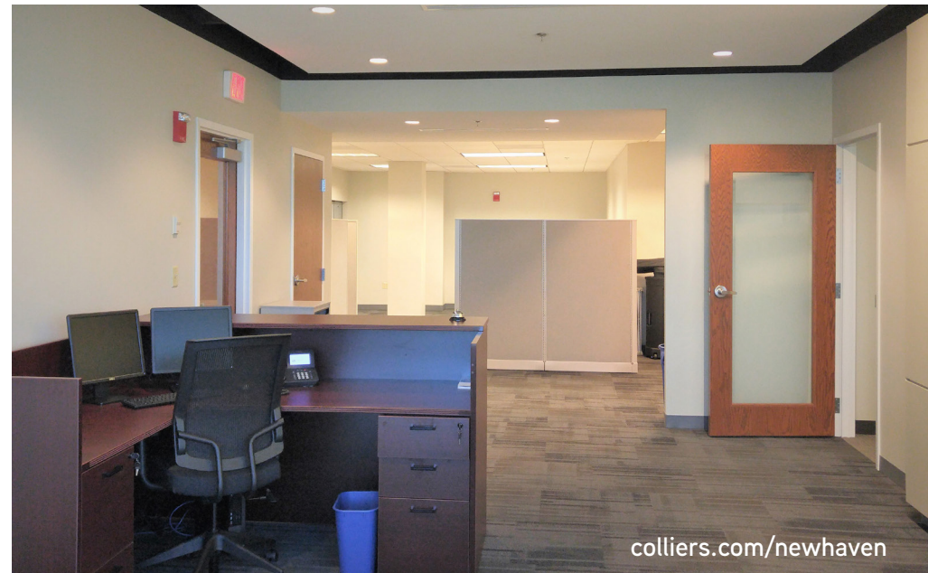
CLOCKWISE FROM TOP LEFT: Conference Room // Work stations // Perimeter office // Reception area // Sweeping views of downtown New Haven