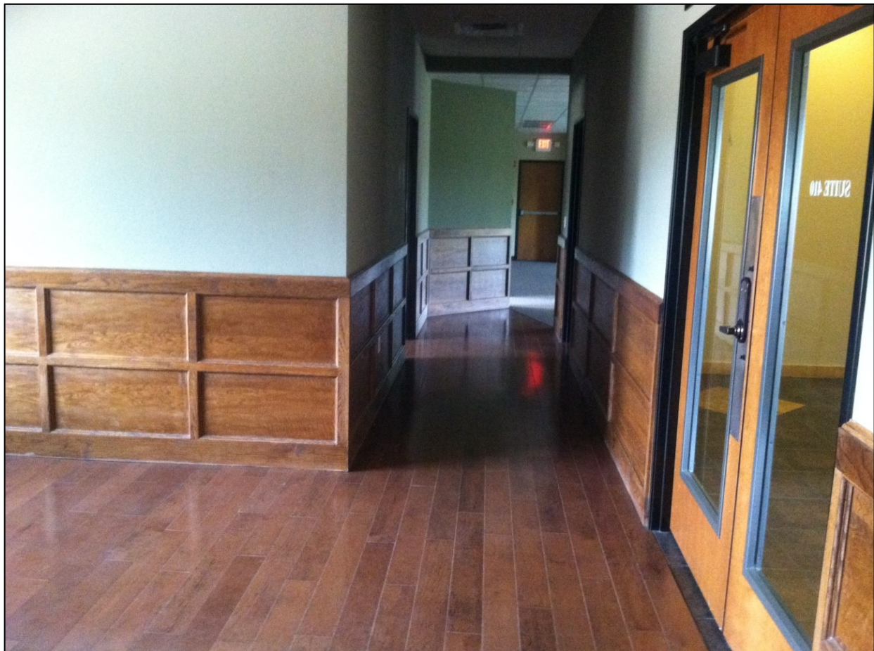
Second Floor, Reception Area

Executive Suites are also available with a shared reception/waiting area, breakroom, conference room and restrooms. Each office is different and ranges from $475 to $700 a month. We also provide free high speed internet and have plentiful free parking.