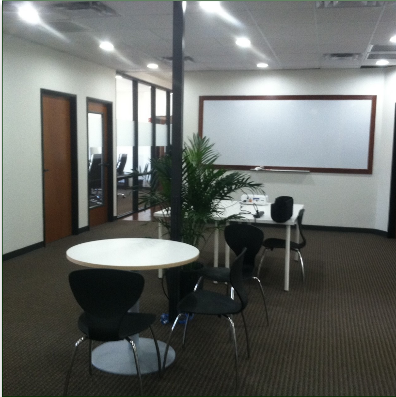
Second Floor—Large Workroom