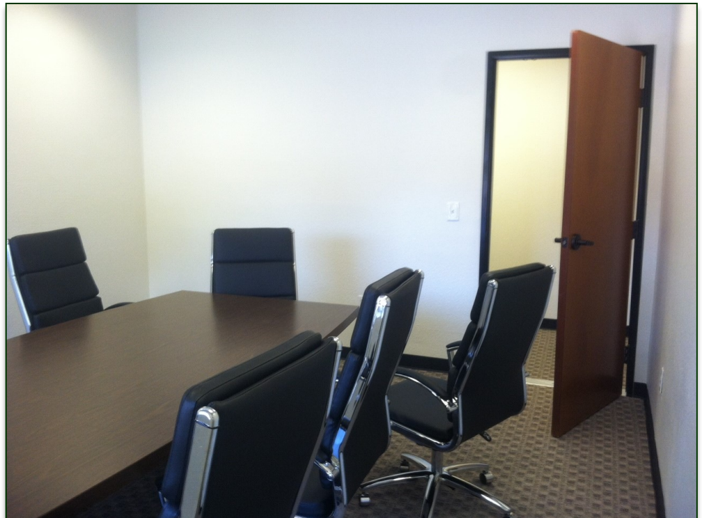
First Floor Conference Room or Office