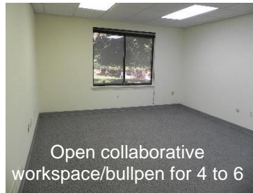
Open collaborative workspace/bullpen for 4 to 6