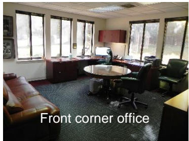
Front corner office