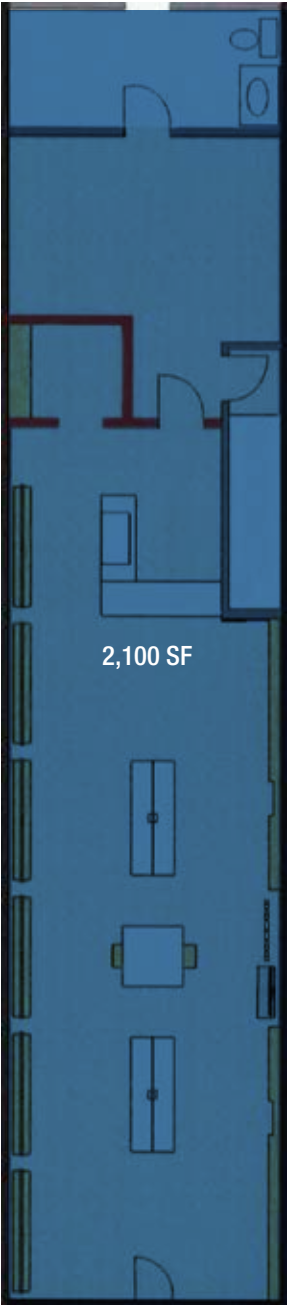
NORTH DAMEN AVENUE