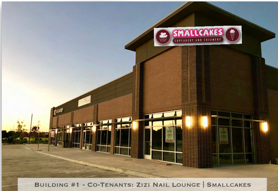
BUILDING #1 - CO-TENANTS: ZIZI NAIL LOUNGE | SMALLCAKES