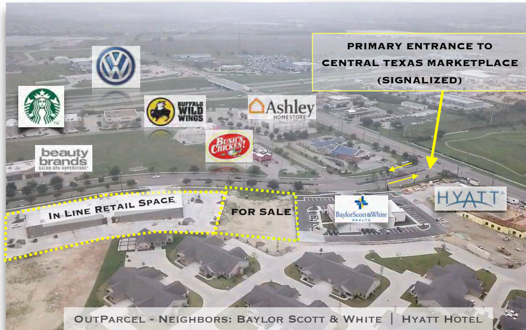
OUTPARCEL - NEIGHBORS: BAYLOR SCOTT & WHITE | HYATT HOTEL