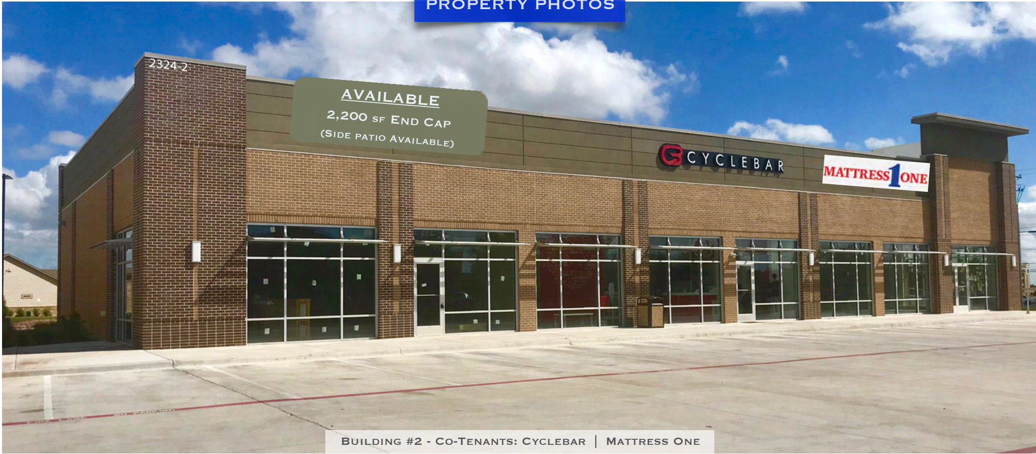
BUILDING #2 - CO-TENANTS: CYCLEBAR | MATTRESS ONE