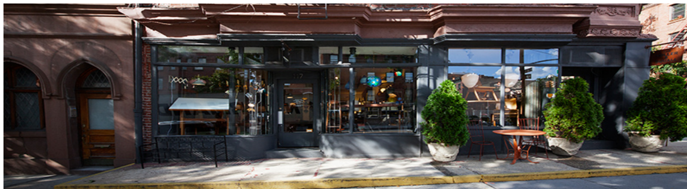
119 Atlantic Avenue