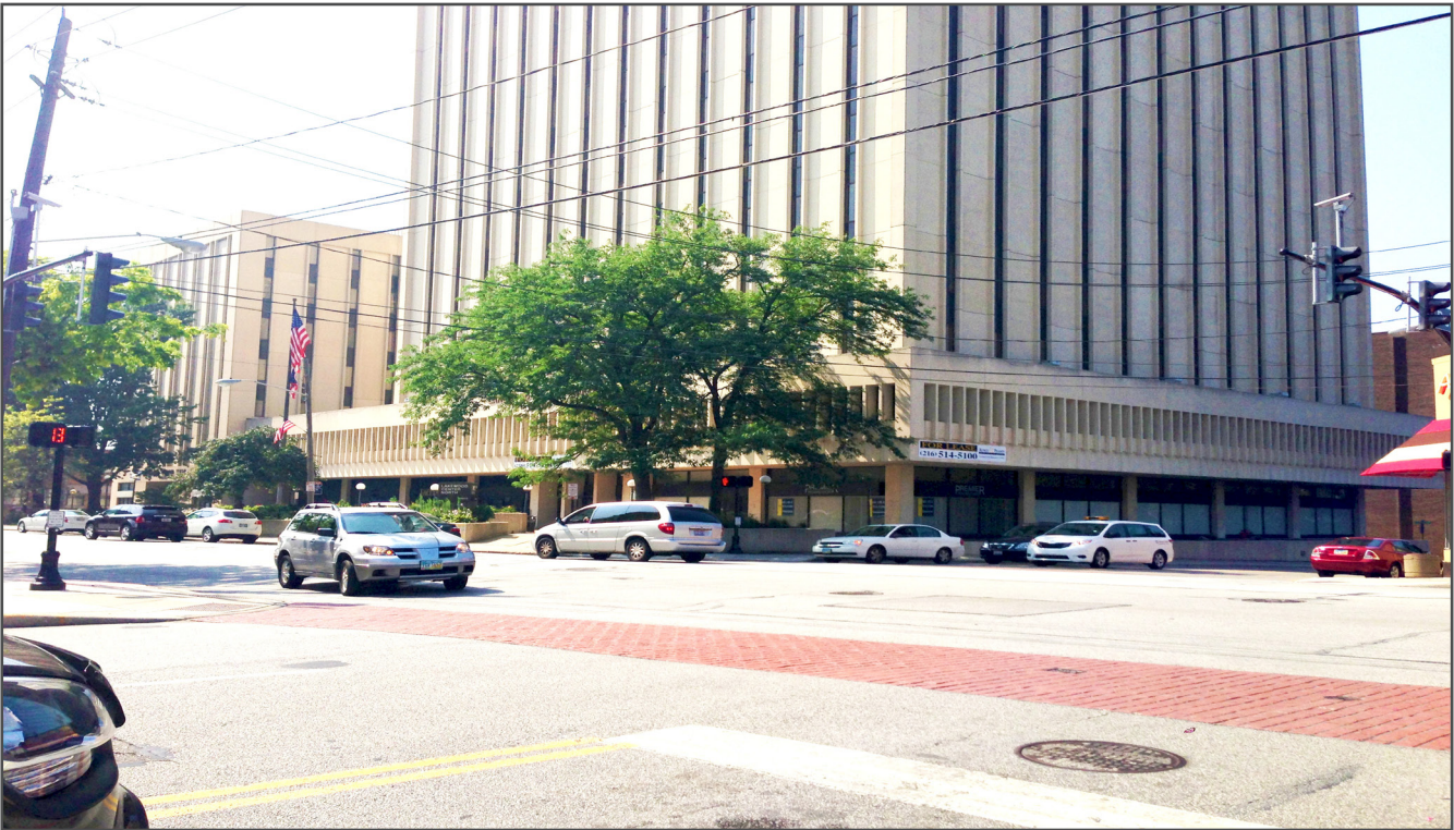
VIEW OF BUILDING