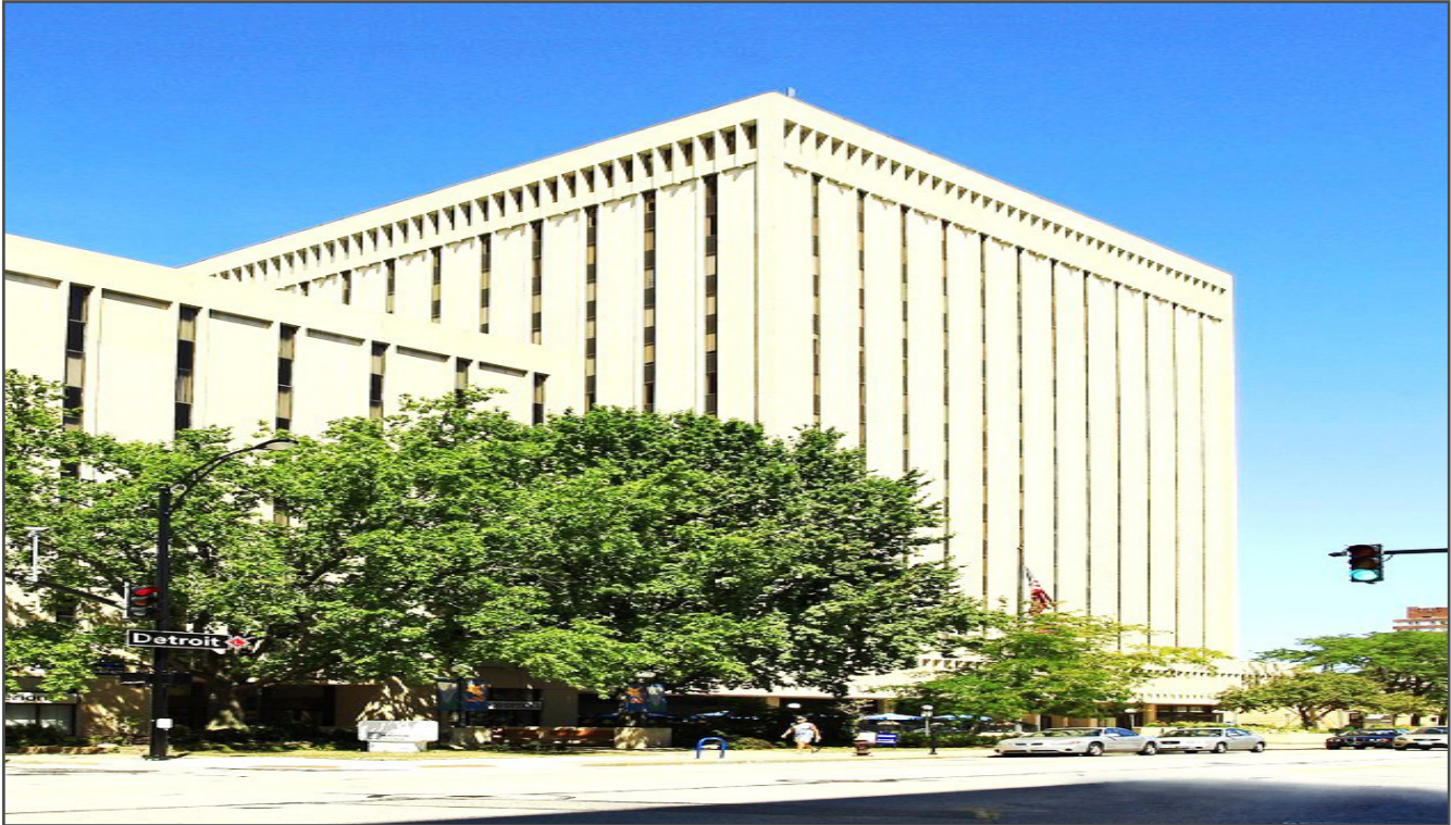
VIEW OF BUILDING