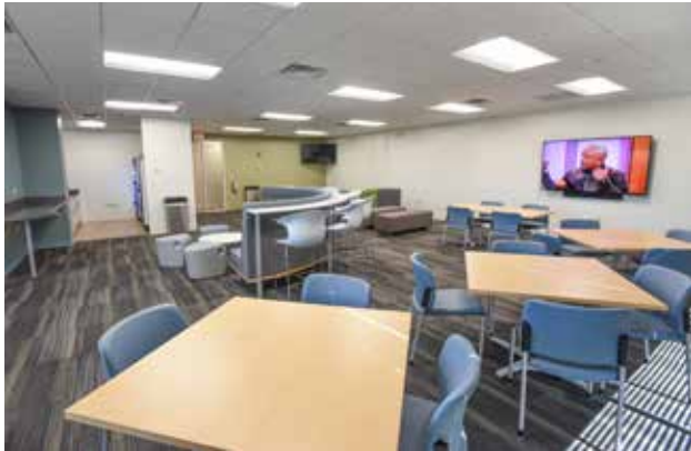
Pfeiffer Woods' multi-purpose room easily converts from a cafe and lounge to a conference room and training facility.

The tenants at Pfeiffer Woods and the Lake Forest Campus share amenities with each building offering something unique