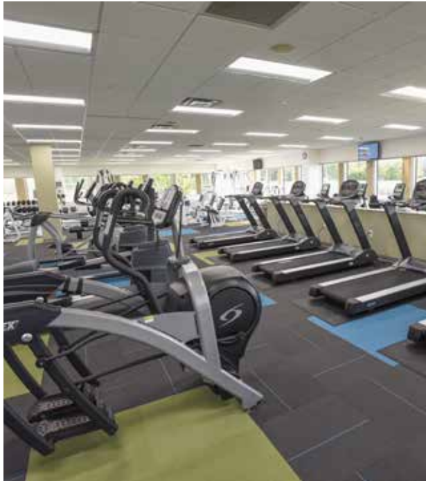
Westlake Center's renovated fitness center provides locker rooms, showers and 24/7 card reader access.