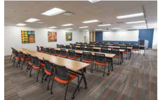
Lake Forest Place's conference center accommodates 50, offers a kitchenette and can be set up in a variety of layouts.