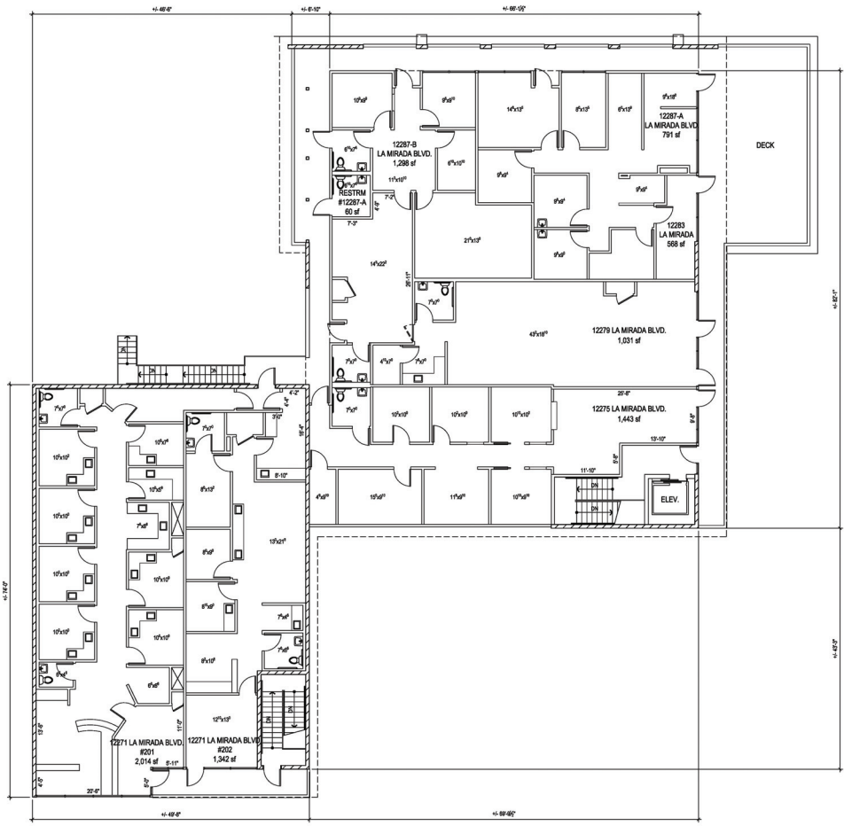
2ND FLOOR PLAN 1/8" = 1'-0" 2