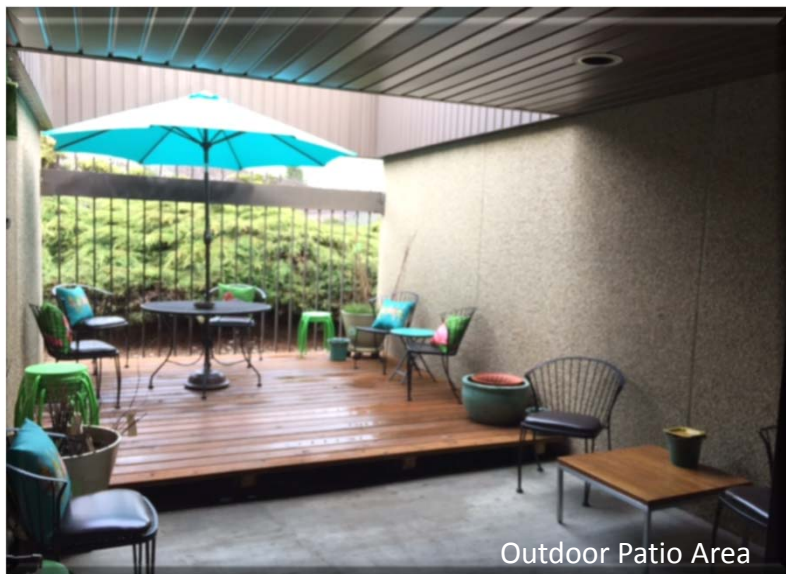
Outdoor Patio Area