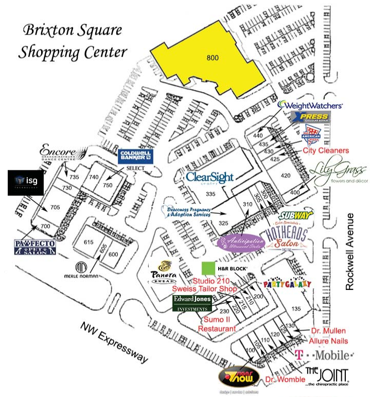
Brixton Square Shopping Center